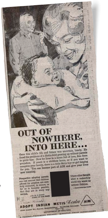
Samplings of just a few of the earliest AIM ads from the late 1960s. Faces at the bottom have been blacked out as per Provincial Archives of Saskatchewan regulations.